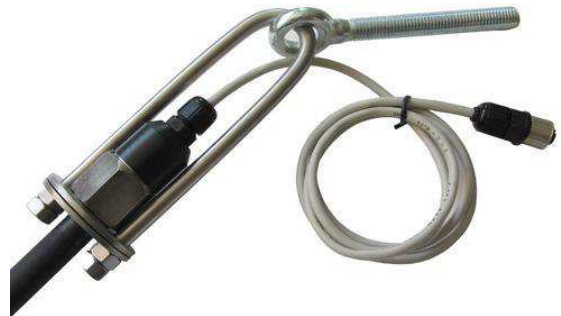
Upper holder assembly