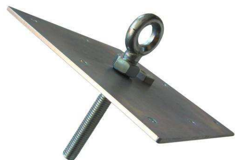
Roof-top holding plate assembly