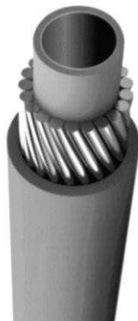
Steel Wire Armoured protection tube