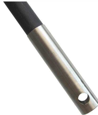
Lower end assembly